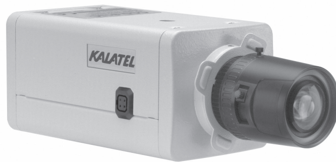
The KTC-210C accepts both C- and CS-mount lenses.

The KTC-210C is a general-purpose color security camera that offers 380 lines of resolution, high sensitivity (.05 lux) and digital signal processing. The KTC-210C accepts both C- and CS-mount lenses. Its automatic backlight compensation prevents important foreground objects from becoming silhouetted against bright backgrounds.