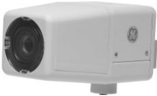
The KTC-247C V3/V9 is designed for easy installation.

The KTC-247C is a high-resolution, ExView*, compact, color camera with integral varifocal DC auto iris lens. The ExpressCam camera series is designed for easy installation and includes a mounting bracket, power supply, and BNC connectors.