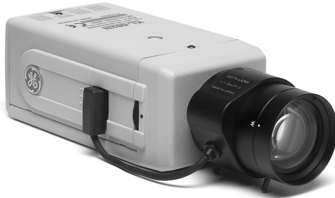
The KTC-815C accepts both C- and CS-mount lenses.

The KTC-815C is a high-resolution color camera that offers 480 lines of resolution, high sensitivity (0.5 lux), and advanced digital signal processing. The KTC-815C accepts both C- and CS-mount lenses. It features digital signal processing, and its automatic backlight compensation prevents important foreground objects from becoming silhouetted against bright backgrounds.